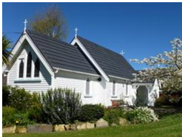
St Paul's Brighton Street, Leithfield