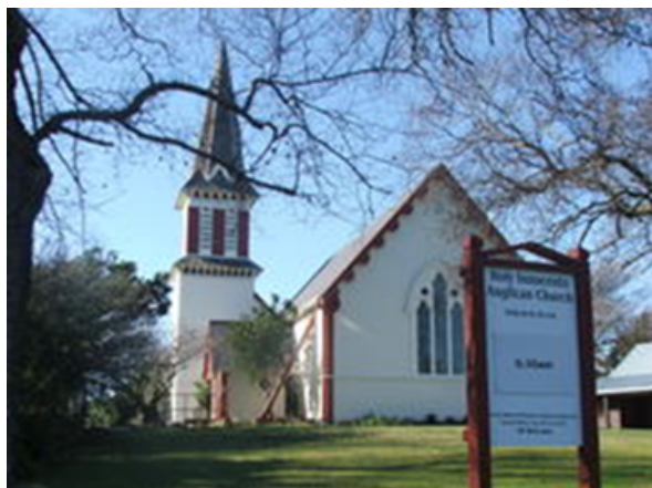
Holy Innocents Church Street, Amberley